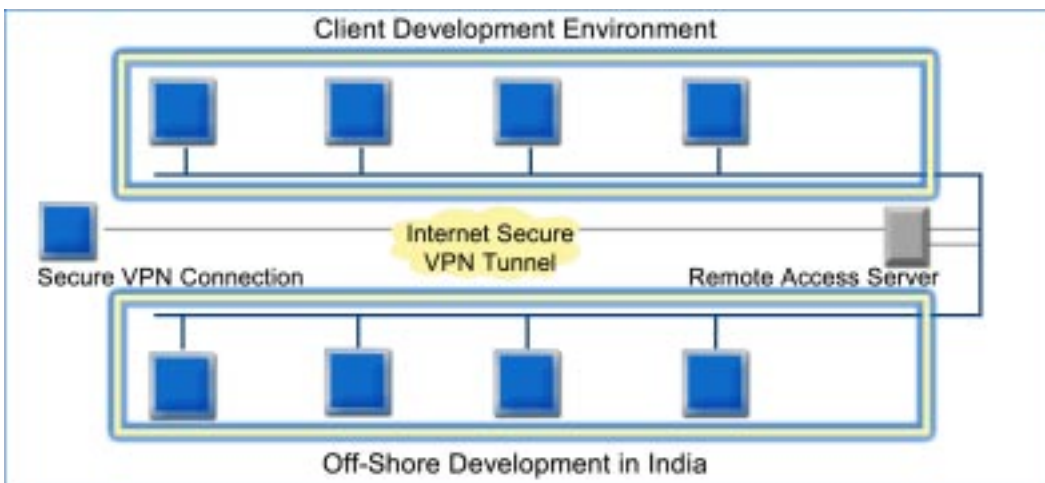
Virtual Team Model